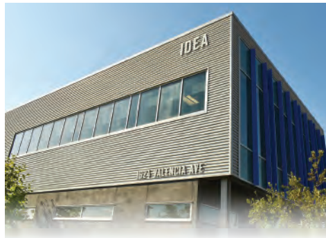
IDEA Building, 2018 Irvine Valley College at ATEP