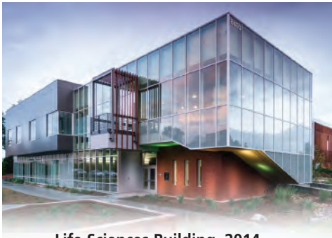
Life Sciences Building, 2014 Irvine Valley College

New buildings enhance the learning experience for both students and instructors. Here are some of the recently completed projects on both campuses: