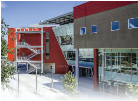
Sciences Building, 2016 Saddleback College