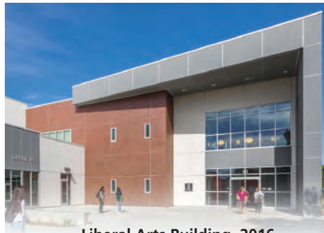
Liberal Arts Building, 2016 Irvine Valley College