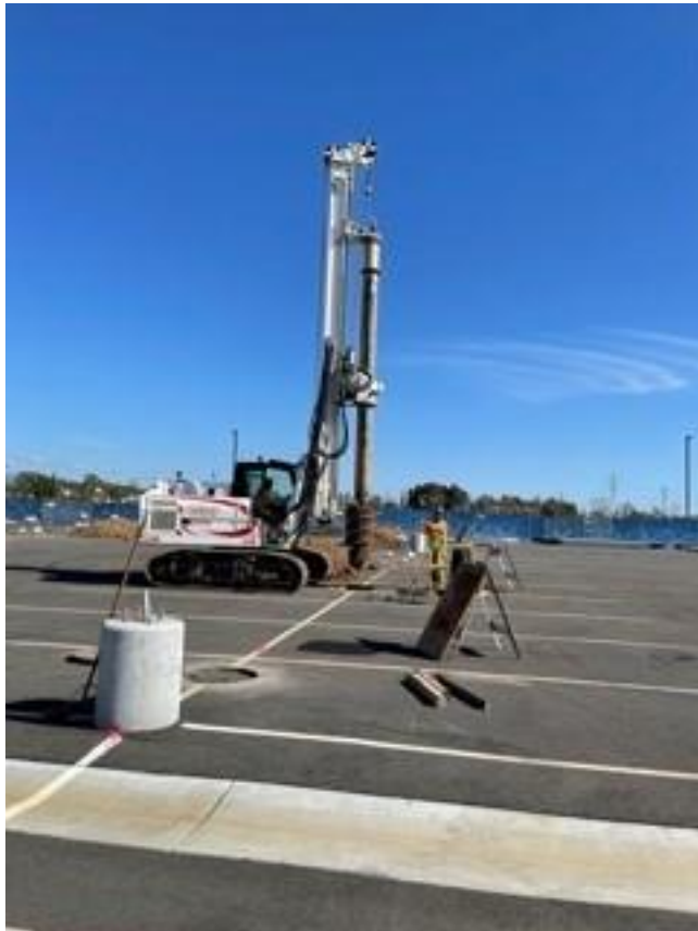
Pier Drilling Operation