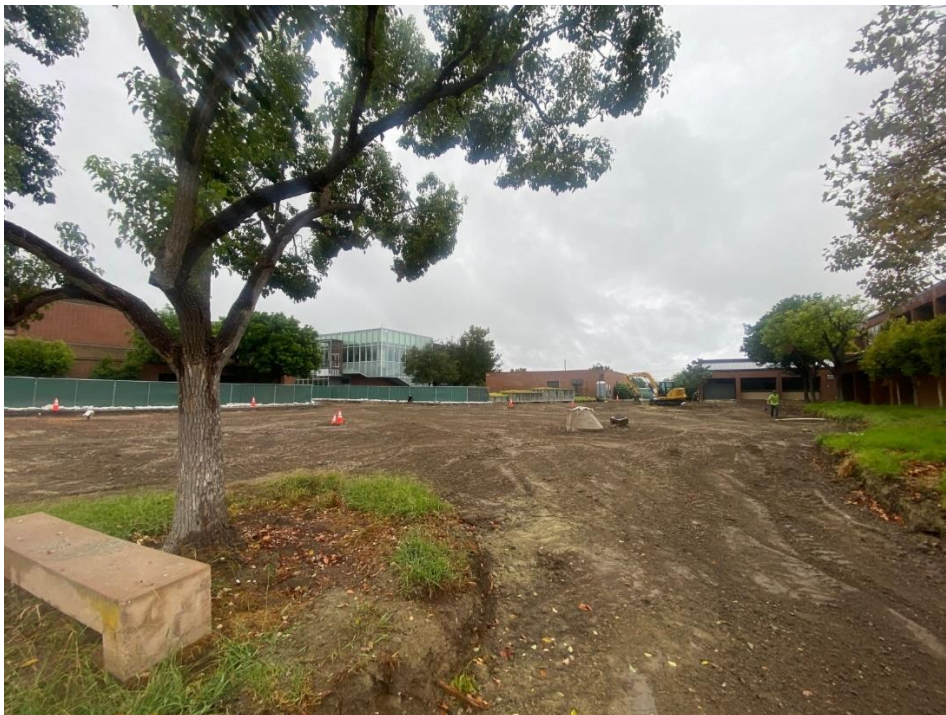
IVC B-Quad Area – Grading and Removal of Concrete at B Quad