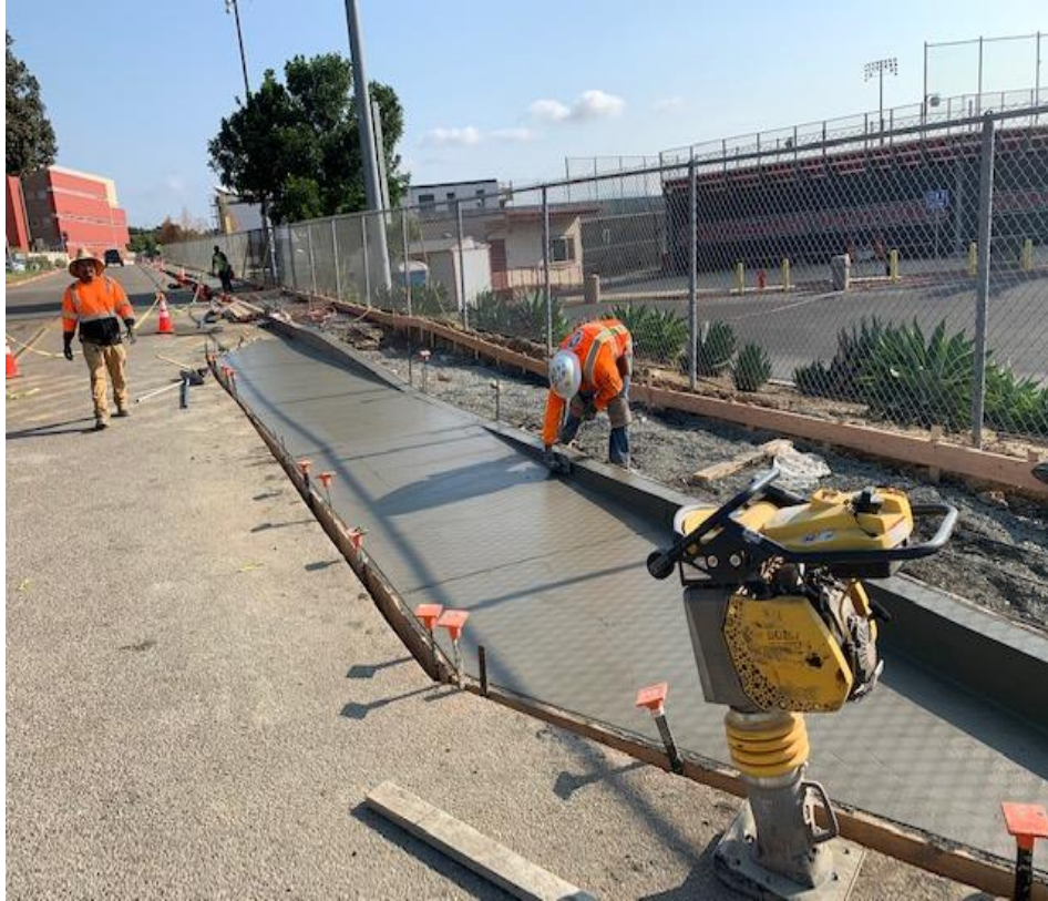
SC Area 6 Sidewalk – Installation of Concrete Sidewalk Apron and ADA Walk Path