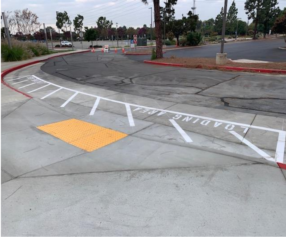
IVC A200 Site Work – Newly Installed ADA Ramp and Traffic Painting