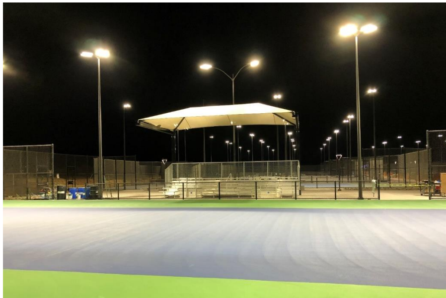
SC Tennis Center – Tennis Courts Sports Lighting at Night