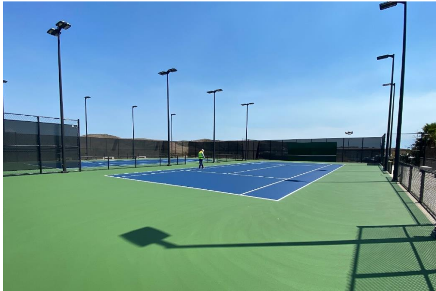
SC Tennis Center – Tennis Courts Surfacing and Striping Operation