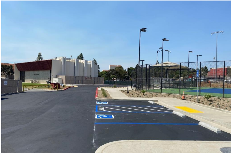
SC Tennis Center – Asphalt Paving and Striping Operation