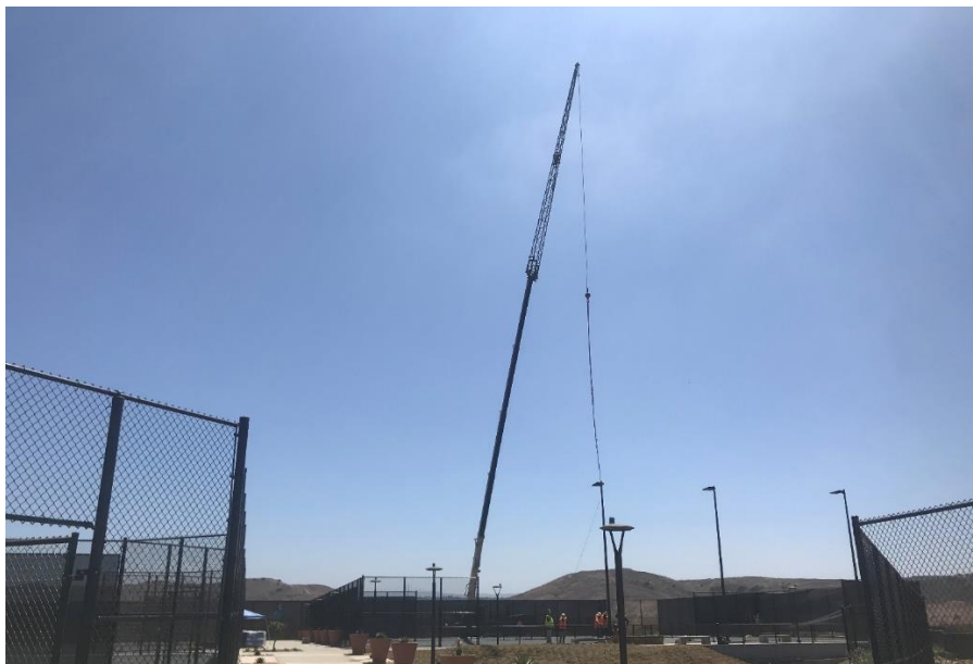
SC Tennis Center – Tennis Courts Sports Lighting Installation with Crane