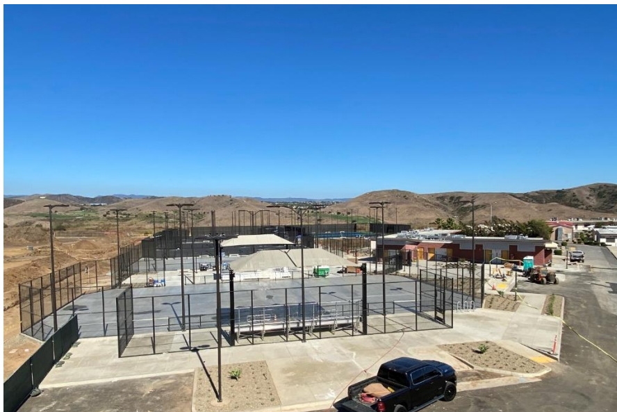
SC Tennis Center – Birdseye Aerial