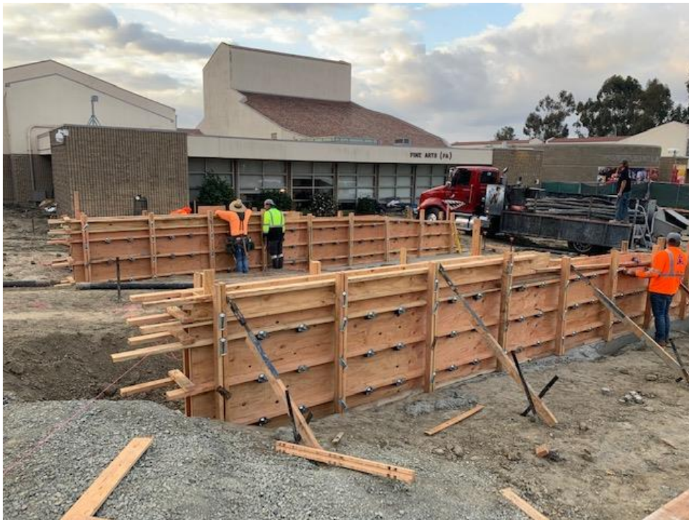
SC Area 5 – Rebar and Formwork for Concrete Walls at Fine Arts Quad