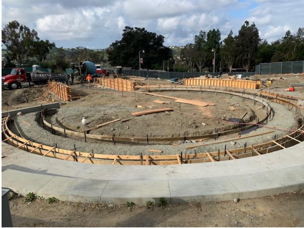
SC Area 5 – Formwork at Logo Concrete Banding in Fine Arts Quad