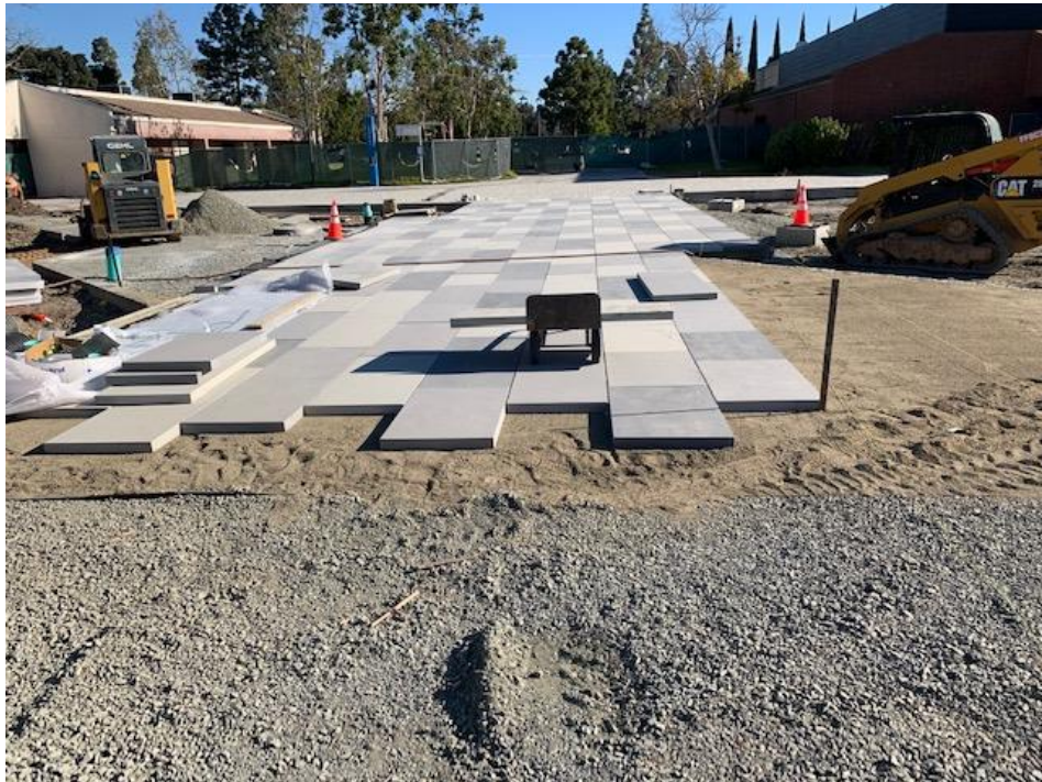
IVC B Quad – Concrete Pavers Installed and Base Compacted