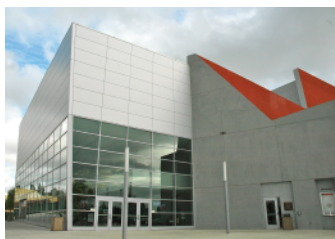
Irvine Valley College , Irvine Students, Fall 2022: 12,776 Year Founded: 1985 Campus size: 100 acres

Student annual headcount, District-wide 2021-2022