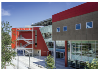
Saddleback College , Mission Viejo Students, Fall 2022: 22,446 Year Founded: 1968 Campus size: 200 acres

Degrees and certificates offered at district colleges