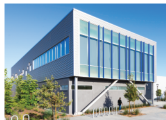
ATEP , Tustin The Advanced Technology & Education Park is a 61.4-acre campus with one completed building and several buildings under construction.

BILLION District annual budget, 2022-2023