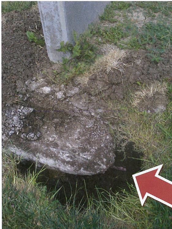
Irrigation line below footing

CONTRACTOR understands that demolition of existing signs shall include foundation removal. The standard condition for removal of existing signage as it relates to potential damage to existing campus hardscape and irrigation lines is defined as one that will contain an irrigation line and may abut to adjacent surface to be protected in place. This is demonstrated in the sample sign from the mandatory job walk and as further shown in picture of same sign below: