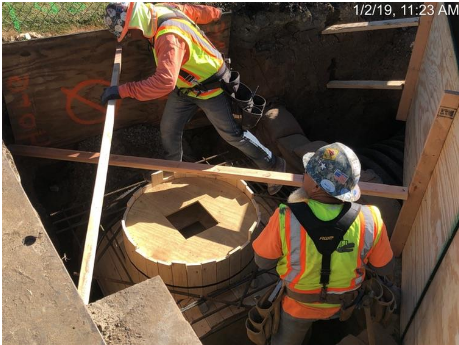
Contractor Preparing New Manhole for the Catch Basin at the Practice Fields