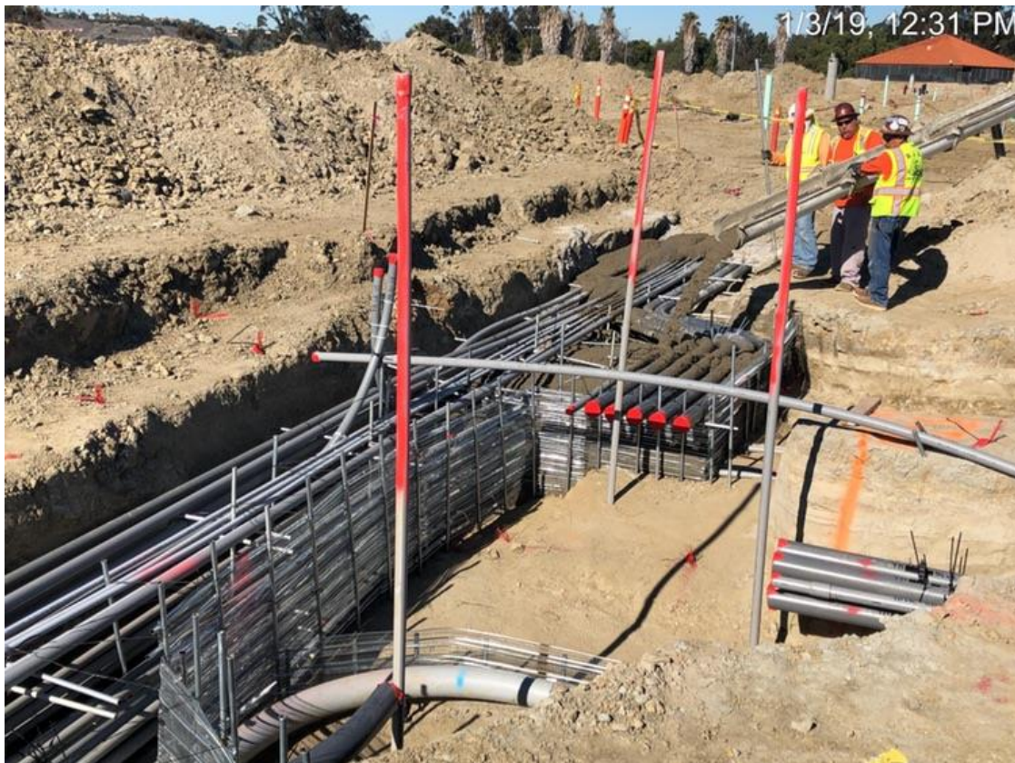
Contractor Placing Conduit for Electrical and Data Duct Banks for the Stadium