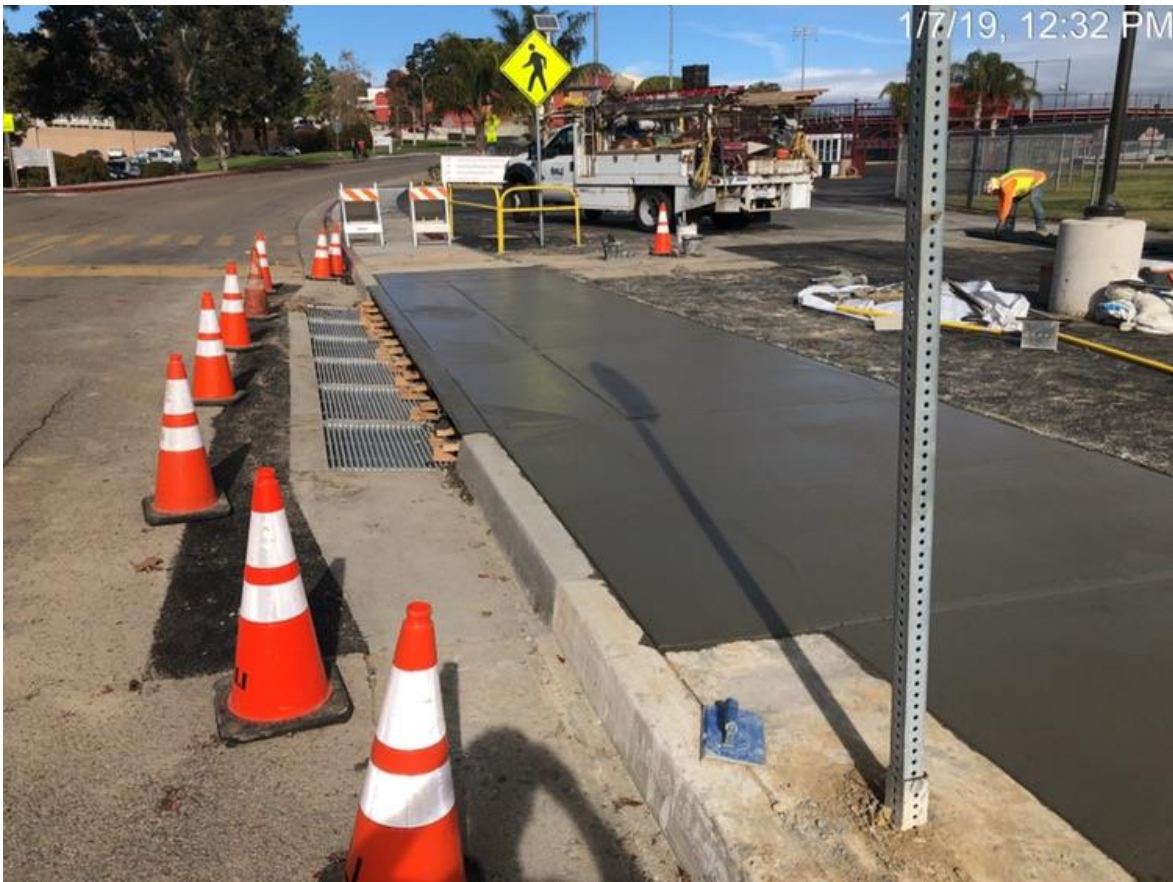
Contractor Placing New Storm Drain Line for the Catch Basin at the Practice Fields